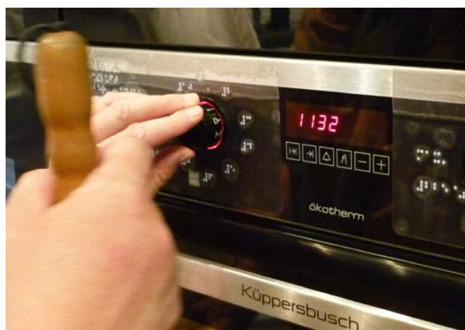
Picture 4: DBSV Küppersbusch / Oven with a braille tape around the rotary selector

The EEBK 6260.0 JX electric oven with rotary selectors made by German kitchen appliances manufacturer Küppersbusch was presented. For test purposes at the IFA, the device's programme and temperature selectors were covered with a braille tape. The appliance also had two additional features that make it of interest to blind and visually impaired users: a self-cleaning system for the oven compartment and an oven hatch that shows the oven on is through the warming of said hatch. Both functions could be of benefit for blind and visually impaired people. Devices without the tactile markings are available as commercial products.