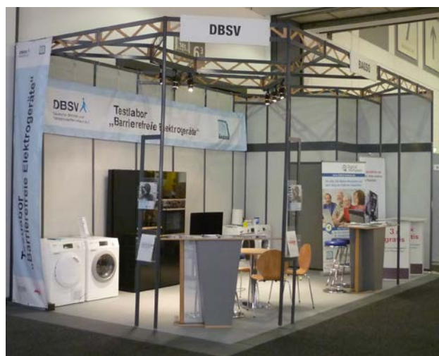
Picture 1: DBSV stand

To prepare for being at the IFA, in the run-up to the trade fair the DBSV sent letters to numerous German and international companies that produce household appliances and/or consumer electronics for the German market. The letter asked to what extent the companies take accessibility into account as part of their product development philosophy and for which devices it specifically applied. Three German and one Korean company were interested in a partnership at the IFA stand: B/S/H/Hausgeräte GmbH , Küppersbusch Hausgeräte GmbH , Miele & Cie. KG , and Samsung Electronics GmbH . Under the motto “Test Lab for Accessible Electronic Devices”, visitors to the DBSV stand could test company-provided items in various stages of development regarding accessibility.