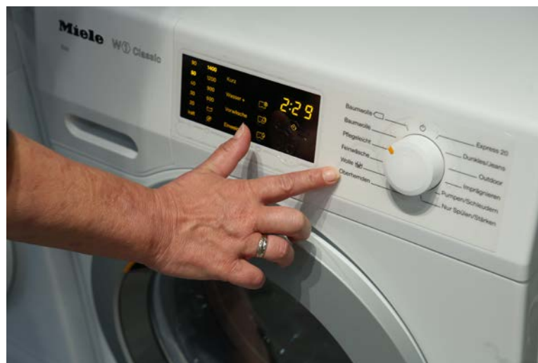
Picture 5: Miele Washing machine with a tactile tape

Miele presented the W1 Classic washing machine, which can be made accessible for blind users with an adaptation, among other things. Applying a tactile tape and pre-setting the machine, which adapts the sensitivity and tonal quality of the touch control panel, makes it possible for blind users to make changes to the standard programme selection. The latter are implemented with a snap-action rotary selector. As part of its overall concept, this solution also contains spoken operating instructions in the DAISY format, which explains the comprehensive operating programme and the instructions for the tactile tape. The operating concept was developed within the company in cooperation with a blind employee. The T1 Classic Dryer with the applied tape was also at the stand for presentation purposes. Both appliances will be commercially available in 2017.