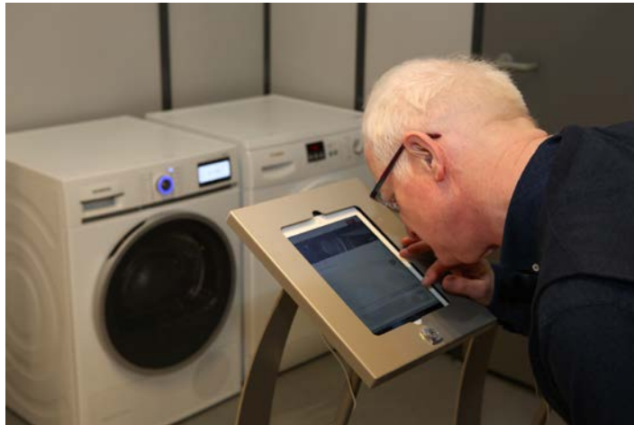
Picture 3: B/S/H Operating a clothes dryer through an app on a tablet computer

B/S/H presented the Bosch washing machine F10-L WAE28220 and the Siemens clothes dryer WT7YH7WO, both of which are button-operated. The Siemens dryer can also be operated with the assistance of an internet-based app, which can be installed on a tablet computer. Through default settings in the appliance, the app can be used through the tablet computer settings for either blind mode or visually impaired mode. Both devices are available as commercial products.