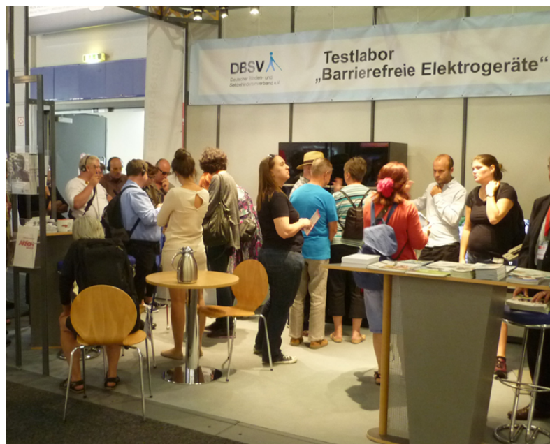
Picture 2: DBSV stand during a tour for blind and visually impaired visitors

The DBSV stand, under the motto "Test Lab for Accessible Electronic Devices", also collected feedback aside from just presenting accessible devices. The detailed results of this feedback were given directly to the exhibiting companies.